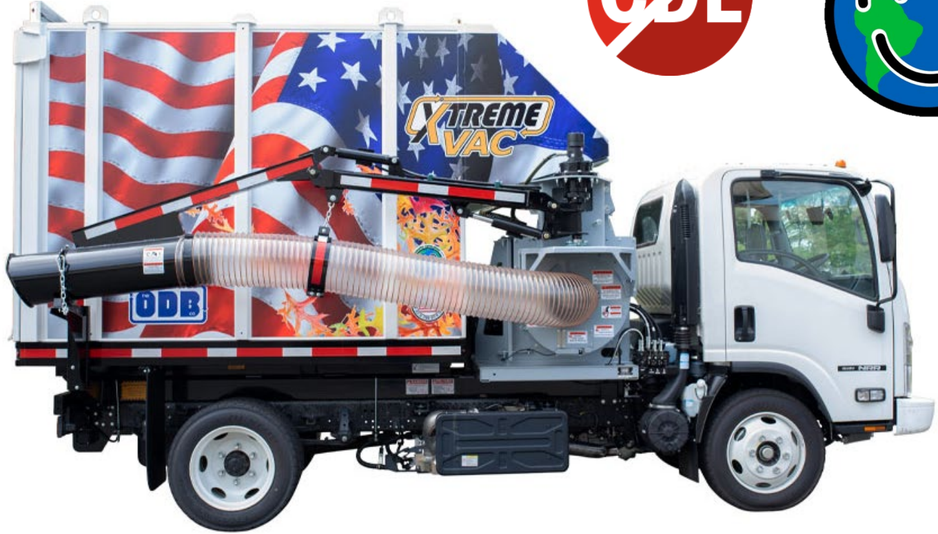
78 HP PSI Gas Engine